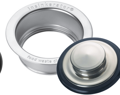
Brushed Stainless Finish Flange - IP74290D Stopper - IP74278D