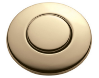
French Gold Finish IP73274G