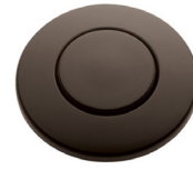
Oil Rub Bronze Finish IP73274E