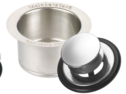
Extended Stainless Sink Flange Flange - IP10082 Silver Saver Stopper - IP72375D