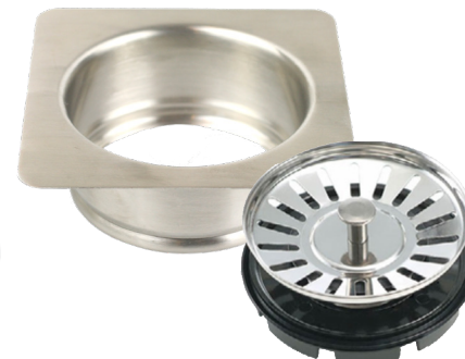
Square Waste Sink Adapter Flange - IP80000 Evolution Strainer Plug - IP75265