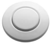
White Finish IP73274J