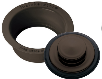
Oil Rub Bronze Finish Flange - IP75076D Stopper - IP75080D