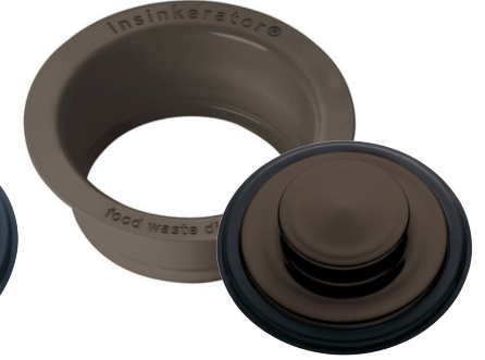
Mocha Bronze Finish Flange - IP75069D Stopper - IP75073D