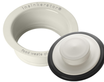
Biscuit Finish Flange - IP73170D Stopper - IP73323D