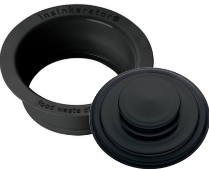
Matte Black Finish Flange - IP75090D Stopper - IP75094D