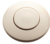
Biscuit Finish IP73274B