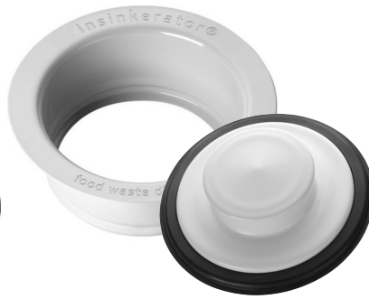
White Finish Flange - IP70908D Stopper - IP70117D