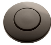
Mocha Bronze Finish IP73274D