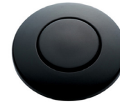
Glossy Black Finish IP73274A