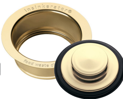
French Gold Finish Flange - IP75083D Stopper - IP75087D