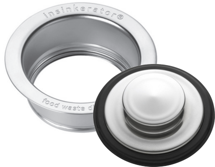
Polished Stainless Finish Flange - IP10025P Stopper - IP5032A

Your food waste disposer is tucked away out of sight under your sink. But, that doesn't mean that it can't make a visual statement in your kitchen. Select a custom sink flange & stopper from one of the many available finishes to give your sink a designer's touch & make a statement about your style.