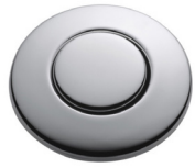
Chrome Finish IP73274K