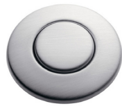
Brushed Steel Finish IP73274