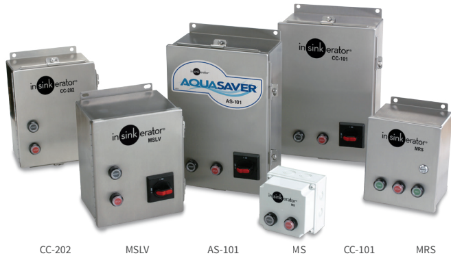
CC-202 MSLV AS-101 MS CC-101 MRS