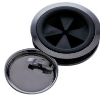
#7 Collar Adaptor with Splash Baffle and Stopper