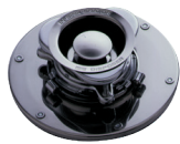
#5 Sink Flange Mounting Assembly